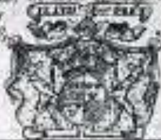
Reversed photograph of print from coffin plate